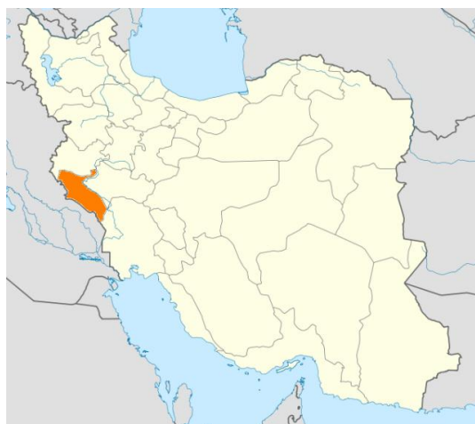
Figure 1: The geographical location of Ilam Province in Iran

Data of suicide attempts were extracted from the systematic registration suicide data (SRSD) system provided by Ilam University of Medical Sciences, Ilam Province (Figure 1). Data on attempted suicide have been collected systematically since 2010. Suicide attempt was defined as cases in which the response indicated suicide and completed suicide was defined as cases in which they died from suicide.