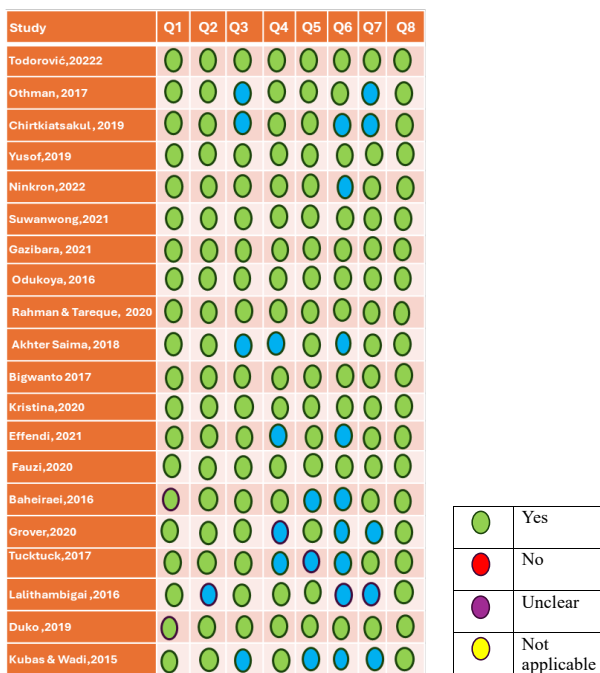
Figure 2. JBI Checklist for the Quality Assessment of Cross-sectional Studies. Q1. Were the criteria for inclusion in the sample clearly defined? Q2. Were the study subjects and the setting described in detail? Q3. Was the exposure measured in a valid and reliable way? Q4. Were objective, standard criteria used for the measurement of the condition? Q5. Were confounding factors identified? Q6. Were strategies to deal with confounding factors stated? Q7. Were the outcomes measured in a valid and reliable way? Q8. Was the applied statistical analysis appropriate?

Individual factors. Various demographic, economic, psychological, attitude and knowledge, and individual behavioral factors were found to be positively correlated with tobacco use among youth. These factors were included in six studies 35-40 on gender (male), three studies 40-42 on low education level, and three studies 40,43,44 that have shown that unmarried individuals and those living away from their families may have fewer social constraints and are